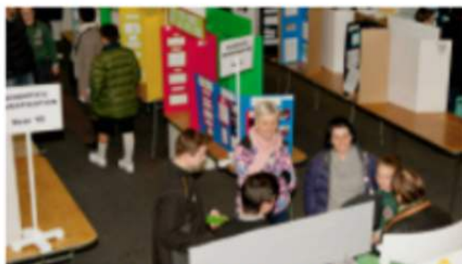
The fair has always attracted hundreds of visitors from students of over 50 schools.

STRATFORD PRESS Taranaki's annual science fair moves to online event for this year 18 Apr, 2020 11:00 AM